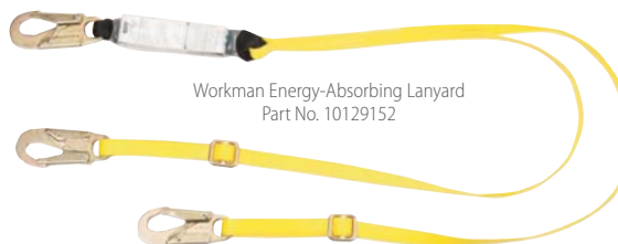
Workman Energy-Absorbing Lanyard Part No. 10129152