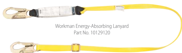
Workman Energy-Absorbing Lanyard Part No. 10129120