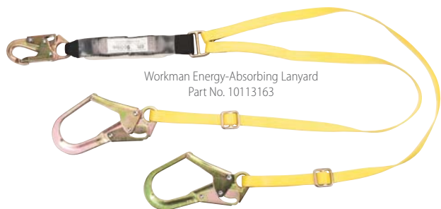
Workman Energy-Absorbing Lanyard Part No. 10113163