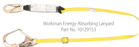
Workman Energy-Absorbing Lanyard Part No. 10129153

When a fall hazard is present, use a lightweight, low-profile Workman Energy-Absorbing Lanyard. The energy absorber not only limits force on the body in a fall, but also on the anchor location. The shock absorber includes a clear, durable protective cover over the labels to increase service life and allow for easy inspection.