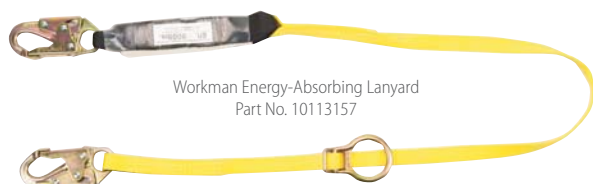
Workman Energy-Absorbing Lanyard Part No. 10113157