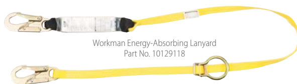
Workman Energy-Absorbing Lanyard Part No. 10129118